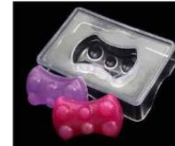
Ergo Flex Mold