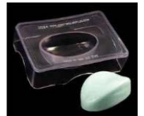
Flex Organic Mold