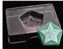
Flex Stacking Stars